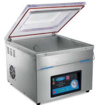
Standard with service pack