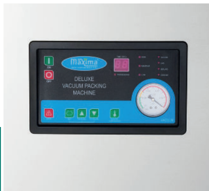
Digital control panel, fully adjustable

Adjustable vacuum time, adjustable sealing time, adjustable sealing temperature and adjustable cooling time